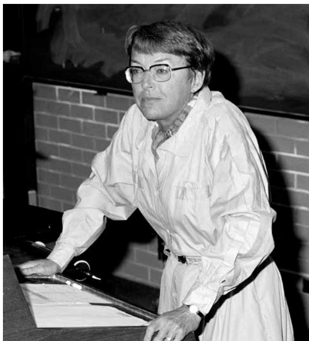
INGA CLENDINNEN IN LECTURING MODE WITH BLACKBOARD CUE, ELT 1987.