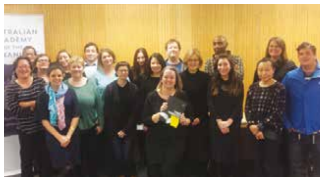
Participants at this year's ECR Workshop program, La Trobe University.

As part of our commitment to supporting the next generation of humanities scholars, we are currently developing a long-term strategy to deepen Academy engagement with Australian humanities ECRs through a range of initiatives that include professional development and mentoring, research promotion, and input to policy development and research. The draft strategy will draw on work undertaken to date by the Academy, as well as considering local and international models.